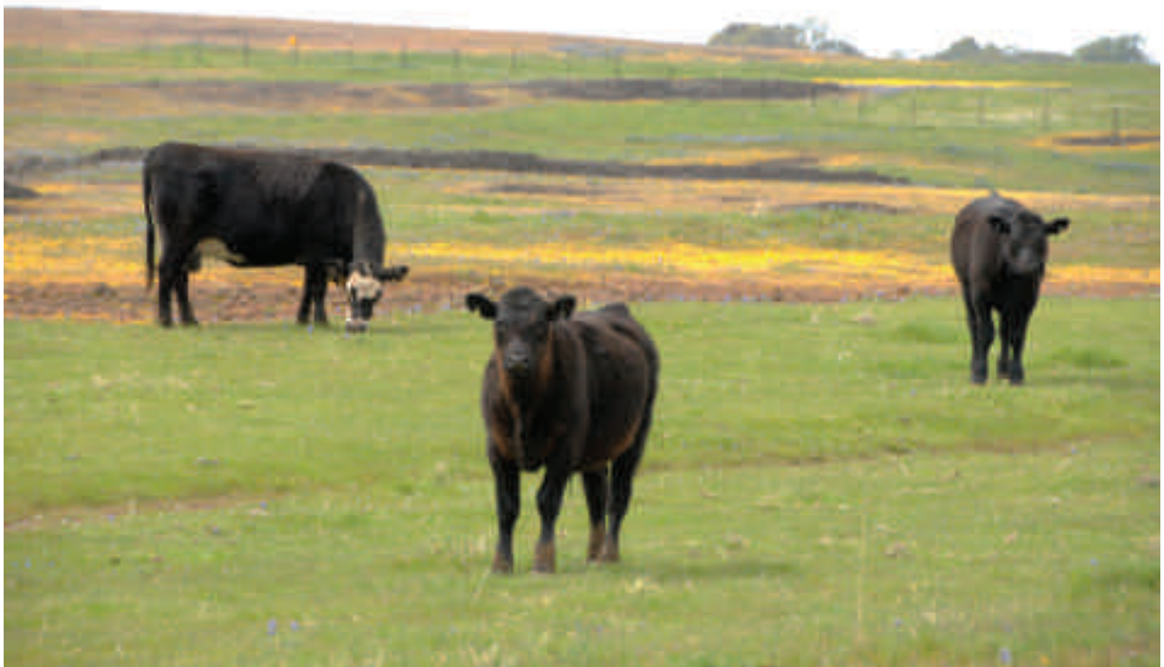
Cattle grazing vernal pools at North Table Mountain Ecological Preserve, managed by the California Department of Fish and Game.

The concept that grazing could be beneficial in the management of California grasslands was not news to the California Native Plant Society. An article in the January 1992 issue of Fremontia describes how grazing could be used to favor native bunch grasses (Edwards 1992). But it was not until years later that research done in California started to provide scientific evidence that