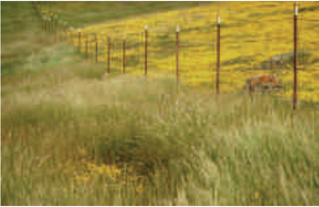
In serpentine soils, grazed sites (right) provided better habitat for the endangered Bay Checkerspot butterfly than ungrazed ones (left).

perwintering habitat for raptors in North America (Pandolfino 2006). California Bird Species of Special Concern (Shuford and Gardali 2008) which use these habitats extensively include Mountain Plover, Burrowing Owl, Loggerhead Shrike, Grasshopper Sparrow, and Tricolored Blackbird.