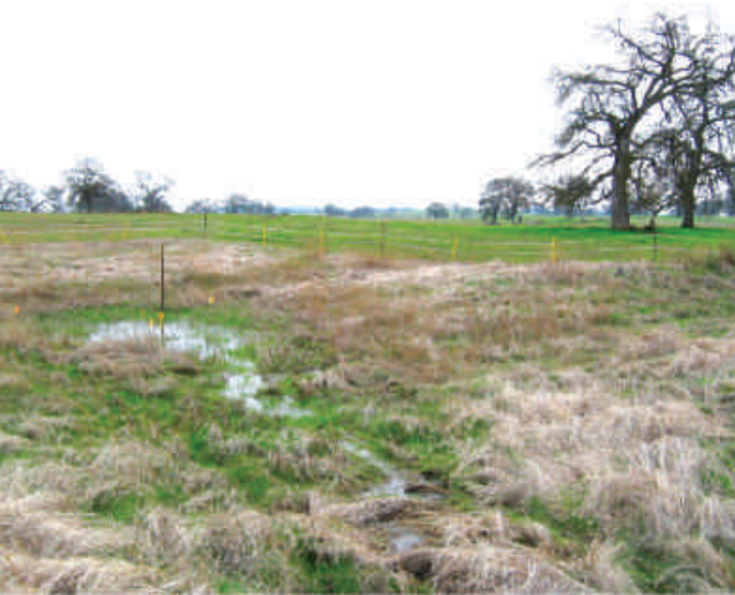
In the absence of disturbance such as grazing, invasive plant species dominate vernal pools, thus reducing biodiversity.

vices such as wildlife habitat and water quality, and increasing native species (see Figure 2), provided that there are incentives available. Relying on the ranchers' desire to become more involved in conservation, Defenders is now working on the development of payments for ecosystem services programs that will give ranchers the opportunity to stay on the land while providing all the environmental benefits that California grasslands produce.