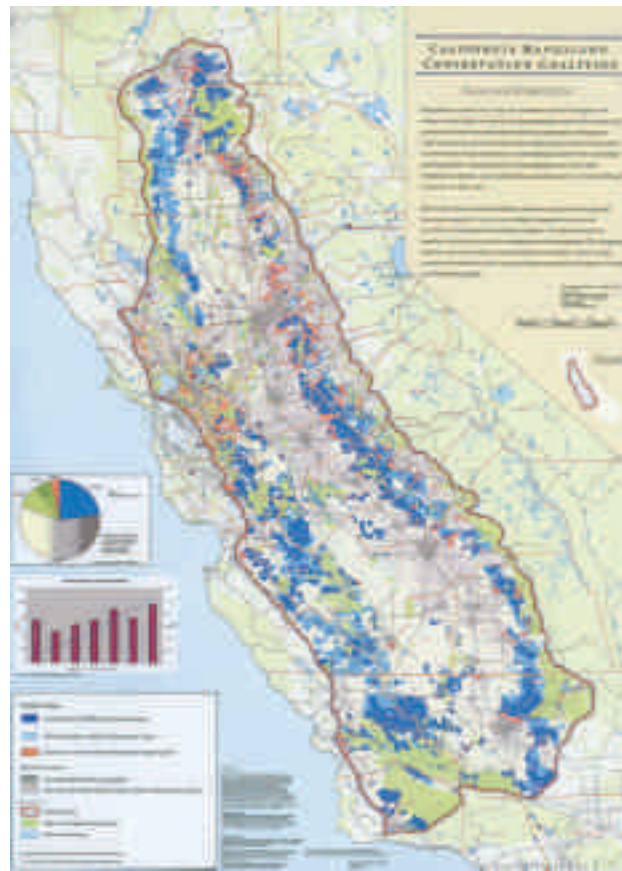
Dark blue shows rangelands of highest conservation value and level of threat of conversion.

in the December issue of the Journal of Wildlife Management (Germano et al. 2011) summarizes ten years of data on the effects of grazing and invasive grasses on desert vertebrates in California. The study concluded that grazing can be used to control exotic non-native grasses and be beneficial to vertebrate species that rely on open habitats, such as the blunt-nosed leopard lizards, giant kangaroo rats, short-nosed kangaroo rats, and San Joaquin antelope squirrels, among others.