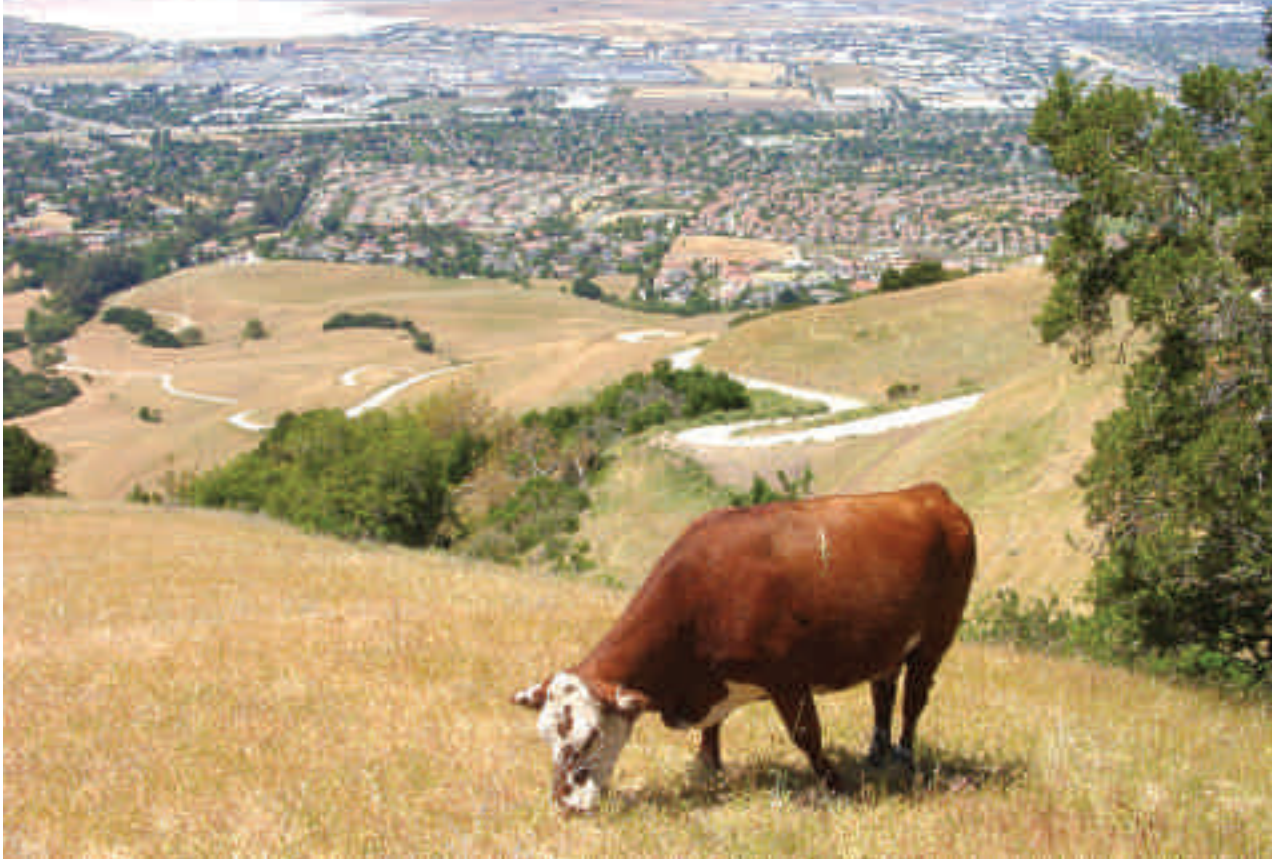
Cattle grazing is used to control invasive species and reduce fire fuel loads at Mission Peak Regional Preserve in Fremont managed by the East Bay Regional Parks District.